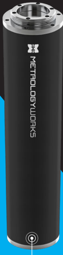
20" Extension (Weight 13.7lbs)