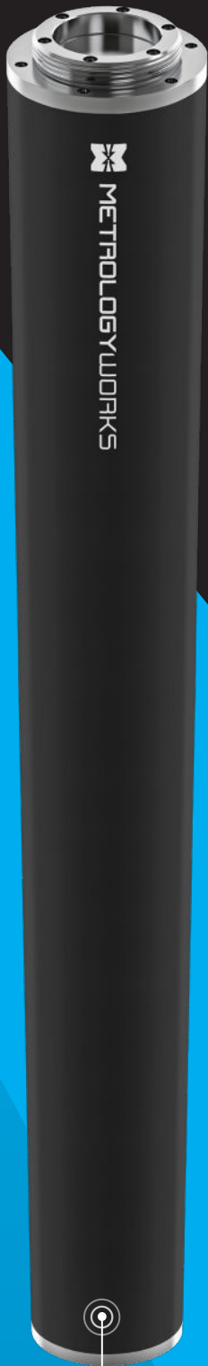
36" Extension (Weight 27lbs)