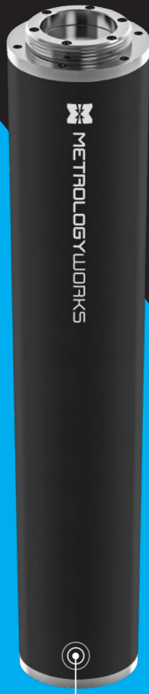
24" Extension (Weight 15.7lbs)