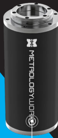
10" Extension (Weight 8.8lbs)