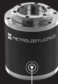
5" Extension (Weight 6.3lbs)